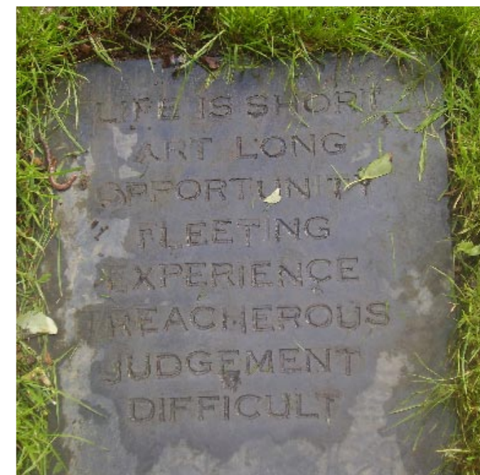
Crudely carved but reverentially placed by an anonymous hand, the words of Hippocrates carry a surreal resonance on a bank at the not-so-New Cathkin Park, while behind the north west corner, studs in a pathway depict the old Third Lanark badge (left), with its number three in the centre. For Glasgow nostalgics and visitors from around the world, this modest arena is a place of pilgrimage. Haunted, but magical also.