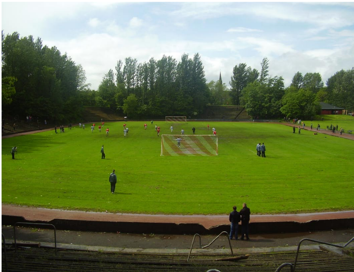
▲ The spire of Crosshill Queen's Park church peeks out behind the trees. A few twisted old barriers remain on sections of terracing. The place: New Cathkin Park . The date: May 19 2007, when to mark the 40th anniversary of the Hi Hi's last outing, the recently revived amateur Third Lanark took on a youth XI from the ground's original tenants, Queen's Park.

All over Britain there are sites where evidence of former grounds can be found; a wall here, a mound there. Highbury Stadium in London has been turned into flats and gardens. Middlesbrough's Ayresome Park, now a housing estate, is dotted with artwork marking the former pitch and penalty spots. But nowhere is there a site quite like Cathkin Park, where football,