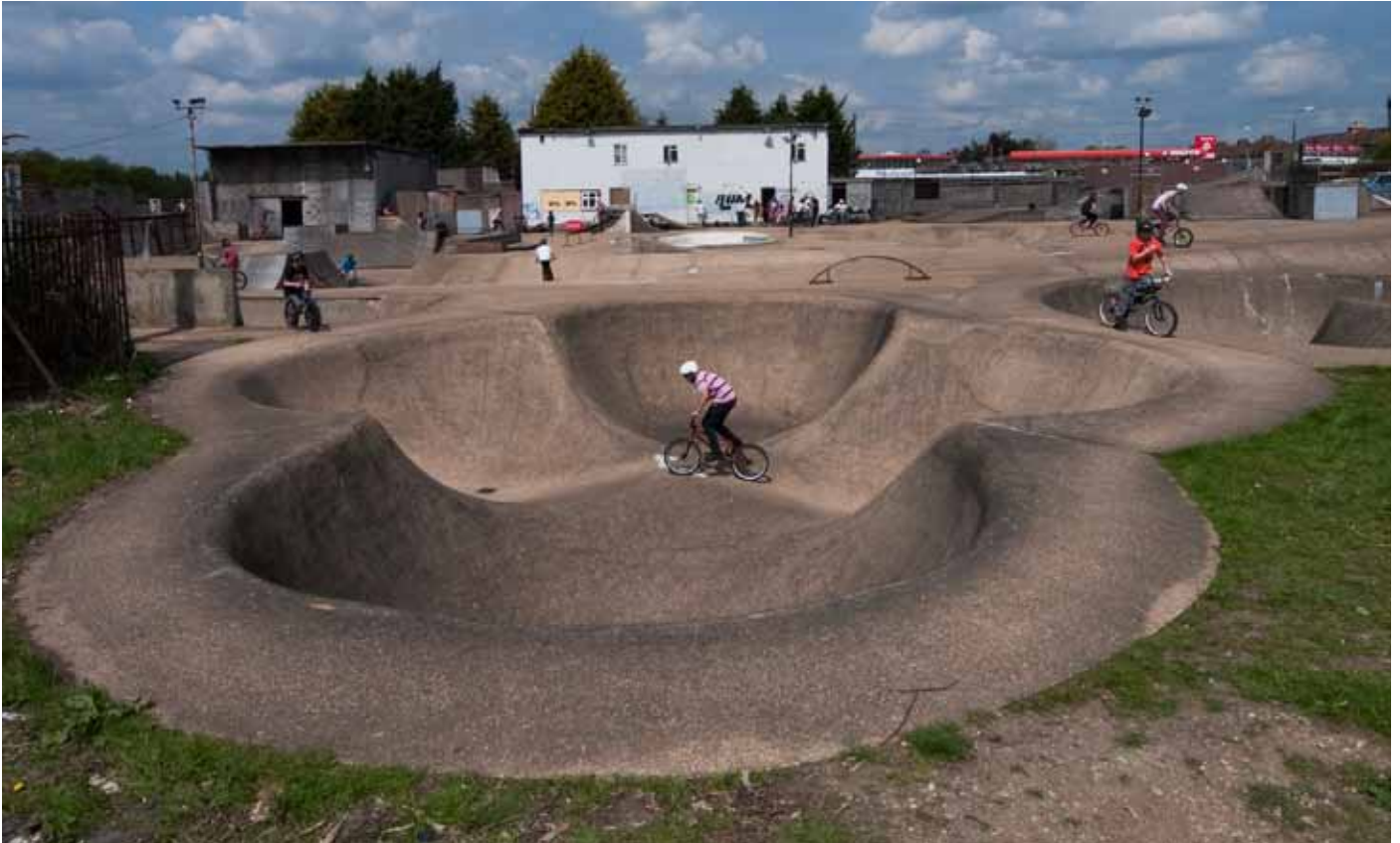
■ The Four Leaf Clover , viewed from the south, with the clubhouse in the background. This is similar to the Moguls, but with four, slightly larger and deeper interconnected craters.