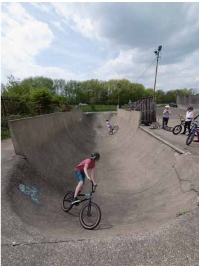
■ The Half Pipe (seen left, from the eastern end) is a long narrow sunken area with vertical walls at the mid point. Apparently one or both of these walls were originally 4.5m tall, but they have since been lowered for safety, for ease of access and to allow the floor of the Half Pipe to dry out more quickly.

The lowering of the side walls in the Half Pipe is believed to be the only substantial alteration to the original design of the Rom Skatepark, and is an alteration that appears to have been common at other skateparks since the 1970s, owing to injuries sustained when skateboarders tried to complete over-head flips between the walls.